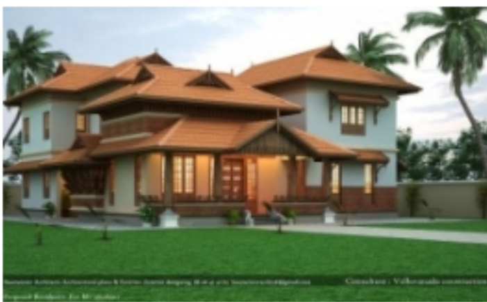
Mixed Chettinadu Style Nalukettu