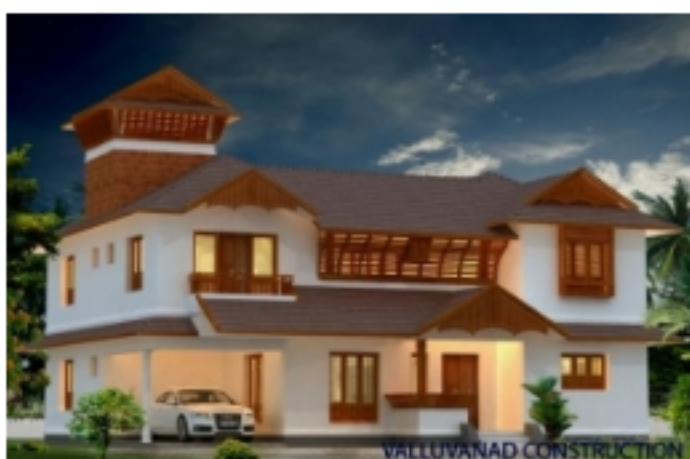
Ultra Modern Nalukettu