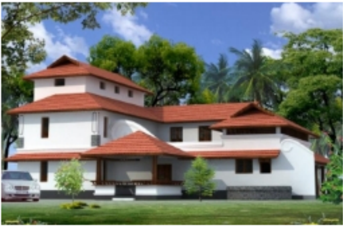
Home stay- Renovation