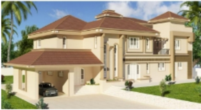
Arabic style Nalukettu